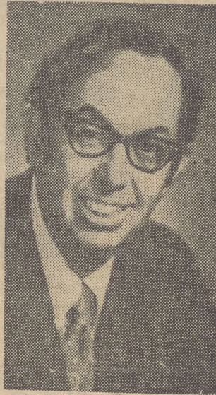
Rep. Caldwell M. Butler

Still, he said, there is still a lot Virginia could do toward encouraging more voting, such as "floating" registrars and providing for the registration of new voters at night and on weekends. Restrictions in the