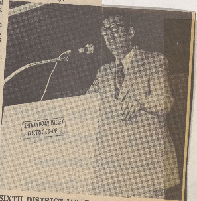
SIXTH DISTRICT U.S. Rep. M. Caldwell Butler discusses national energy policy in a speech Saturday before members of the Shenandoah Valley Electric Cooperative.