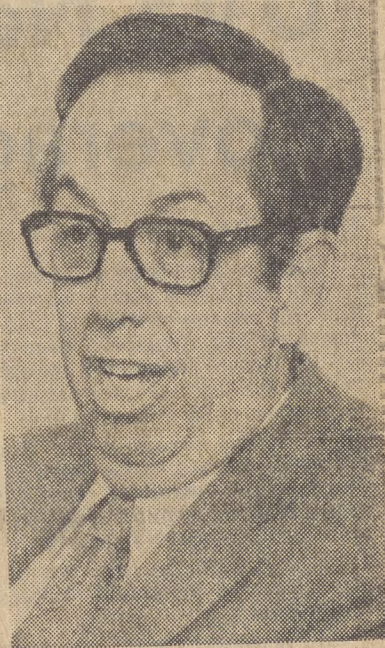
Rep. M. Caldwell Butler

Butler also pointed out that the high cost and limited supplies of natural gas are being felt by the farmer in the form of shortages of nitrogen fertilizer and shortages of natural gas used in drying crops.