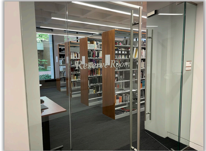
The Reserve Room on Level 3 has the newest editions of popular study aids. New signage makes it easy to find what you need.

Study Aids. Don't forget the wide array of print and online materials the Law Library provides to help supplement your studies and boost your understanding before exams. See our Beyond the Text guide to 1L and upper-level subjects, including online West Academic and Lexis Nexis Digital Library offerings and Reserve Room print titles.