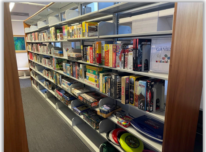
The Recreation Collection in the Reserve Room on Level 3 has a range of entertaining items and activities for your next study break.

And be sure to check out the recently updated Recreation Collection located in the Reserve Room on Level 3. There you'll find a selection puzzles, board and card games, frisbees and balls, movies and TV shows on DVD, and a special collection of fiction, history, and biographies.