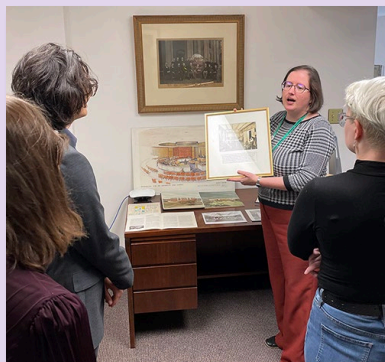
Students learn about W&L Law's unique historical items as part of recent tours of the Powell Archives.

H ave you ever wondered what goes on behind the closed doors of an archive? If so, then you're not alone. Archives are often shrouded in mystery and archivists have struggled to shake off the stereotype of dark, dusty shelves full of old books and papers that regular folks aren't allowed to touch without gloves. (In fact, gloves are discouraged when handling books and manuscripts as they decrease manual dexterity and increase the likelihood of causing damage!)