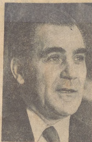
SEN. WILLIAM L. SCOTT ... defends Nixon

Sen. William L. Scott (R-Va.), one of the few who reported little reaction from his constituents to the fir-