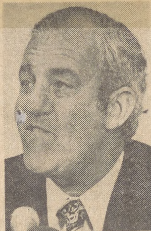
SEN. J. GLENN BEALL ... "partisan politics"

Another Maryland congressman, Democrat Paul Sarbanes of Baltimore, issued a statement calling the President's action an "arrogant abuse of executive power" and saying; "This country does not function under one man's rule." One of Sarbanes's aides said the congressman received many calls strongly against the President's actions.