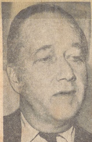
SEN. CHARLES MATHIAS ... constituents agitated

not plan to introduce an impeachment resolution because "I don't think my services will be needed. I think there will be a rush among senior Congressman to institute these proceedings now." Fauntroy may not vote but can introduce bills and resolutions.