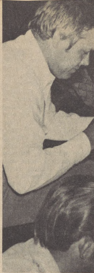
AUTOGRAPH SEEKERS throng Tom T. Hall last night at Expo '73 performance. While Mr. Hall