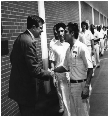
Charles Colson ministering to prisoners

the Council of the Indies. 40 The historian Lewis Hanke writes that “[p]robably never before or since has a mighty emperor . . . ordered his conquests to cease until it was decided if they were just.” 41 Casas’ example is so striking, in fact, that some have attempted to detach him from church history and reimagine him as a secular Enlightenment thinker. Although Casas believed himself to be propounding the traditional Christian position, the argument goes, he was in fact preempting Rousseau. 42 This position demonstrates a dismissive ignorance of the church history already discussed. In appealing to Christianity to oppose imperialism, Casas was walking a millennia-old path already trodden—in the classical and middle ages—by Ambrose and Alcuin. It is far less likely that Casas was a closet secularist than that he was influenced by a savior who said “I came to cast fire on the earth, and would that it were already kindled.” 43