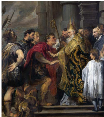
Saint Ambrose barring Theodosius from Milan Cathedral, A. van Dyck, 1619–1620

In 390 AD, during the Christian era of the Roman Empire, the Emperor Theodosius responded to an uprising in Thessalonica by rashly ordering a massacre of the population. 6 “Multitudes were mowed down like ears of grain in harvest-tide,” wrote the historian Theodoret; “It is said that seven thousand perished.” 7 At the time, Aurelius “Ambrose” Ambrosius, Archbishop of Milan—known today as the mentor of Augustine—was the most prominent leader of the church. 8 When Theodosius went to the cathedral at Milan to receive communion, Ambrose protested the massacre by personally blocking the emperor from entering 9 —an event that has been powerfully illustrated by Anthony van Dyck. 10