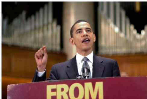
Then-Senator Barack Obama delivering his 2006 “Call to Renewal” speech.

Insofar as this interpretation is what separationists actually mean, then phrases like “religion has no place in politics” are nothing more than devices to willfully obscure their true position—and they should be identified as such. 58 Theists are happy to assert our own position straightforwardly; we resist atheistic arguments in politics because we have concluded that atheism is not true. If atheists are to discourse with religious believers, then they should adopt the same candor—and should not attempt to frontload the discussion with tricks.