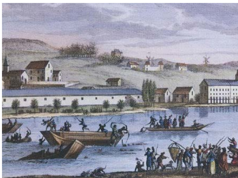
The Jacobins drowned thousands of Christian men and women in the Loire. Jean-Baptiste Carrier, who oversaw the executions, said “Never have I had so much amusement as in seeing the last grimaces of priests as they die.”

Far from prizing egalitarianism in the modern, Marxist sense, Christianity upholds variety of position and role as a thing of intrinsic value. Paul writes that “there is one body, but it has many parts . . . If the whole body were an eye, how could it hear? If the whole body were an ear, how could it smell?” 51 It is variety that gives rise to the beauty of complementarity, and so it is variety—and not the deadening sameness of totalitarianism—that reflects the nature of a fundamentally relational God. The New Testament makes this apparent in, among other areas, its picture of marriage: “For the husband is the head of the wife even as Christ is the head of the church, his body, and is himself its savior . . . Husbands, love your wives as Christ loved the church and gave himself up for her.” 52 In this way, the complementarity of the Christian social order models the interpersonal aspect of God.