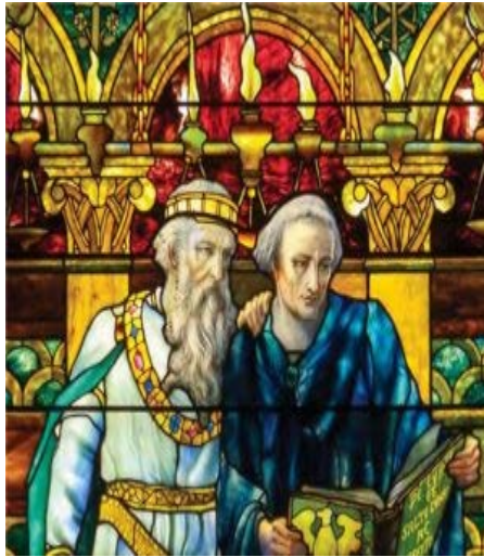
Stained glass window depicting the friendship of Charlemagne and Alcuin, Lafayette College.

Fredegund's repentance differs from the Emperor's not only because of her greater fondness for killing, but because—so far as I know—Fredegund did not have an Ambrose to correct her. In the darkness of Fredegund's tragedy, Christianity itself may have stood as her strange and surprising conscience—speaking for the voiceless even without a living voice to proclaim it. Certainly, there are countless verses in the Bible that may have moved her—too many to list them all here. Yet it is hard not to imagine that Fredegund had in mind the words of the prophet Amos: “Therefore because you trample on the poor and you exact taxes of grain from him, you have built houses of hewn stone, but you shall not dwell in them; you have planted pleasant vineyards, but you shall not drink their wine.” 29