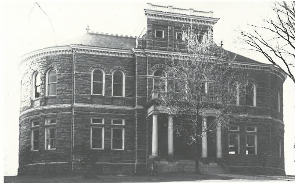
268. Tucker Hall (1899-1900)