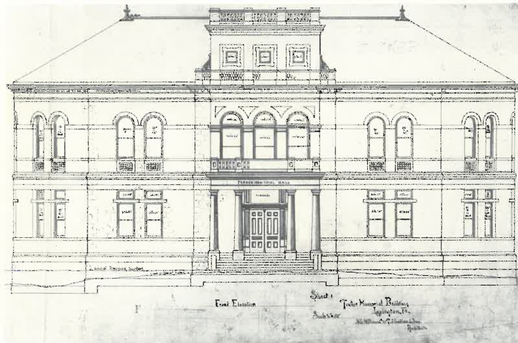
269. Architect's elevation drawing, Tucker Hall