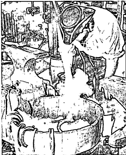
The village farrier making a horseshoe at Liberty Village, Flemington, N.J., site of a recent NCRE Board Meeting.