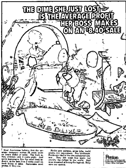
Sample of posters used by A-T-O Inc. to promote private enterprise within their corporation. These thought-provoking posters are printed by the Penton Publishing Company, Cleveland, Ohio 44114, and can be purchased in sets of six posters for $10.00.