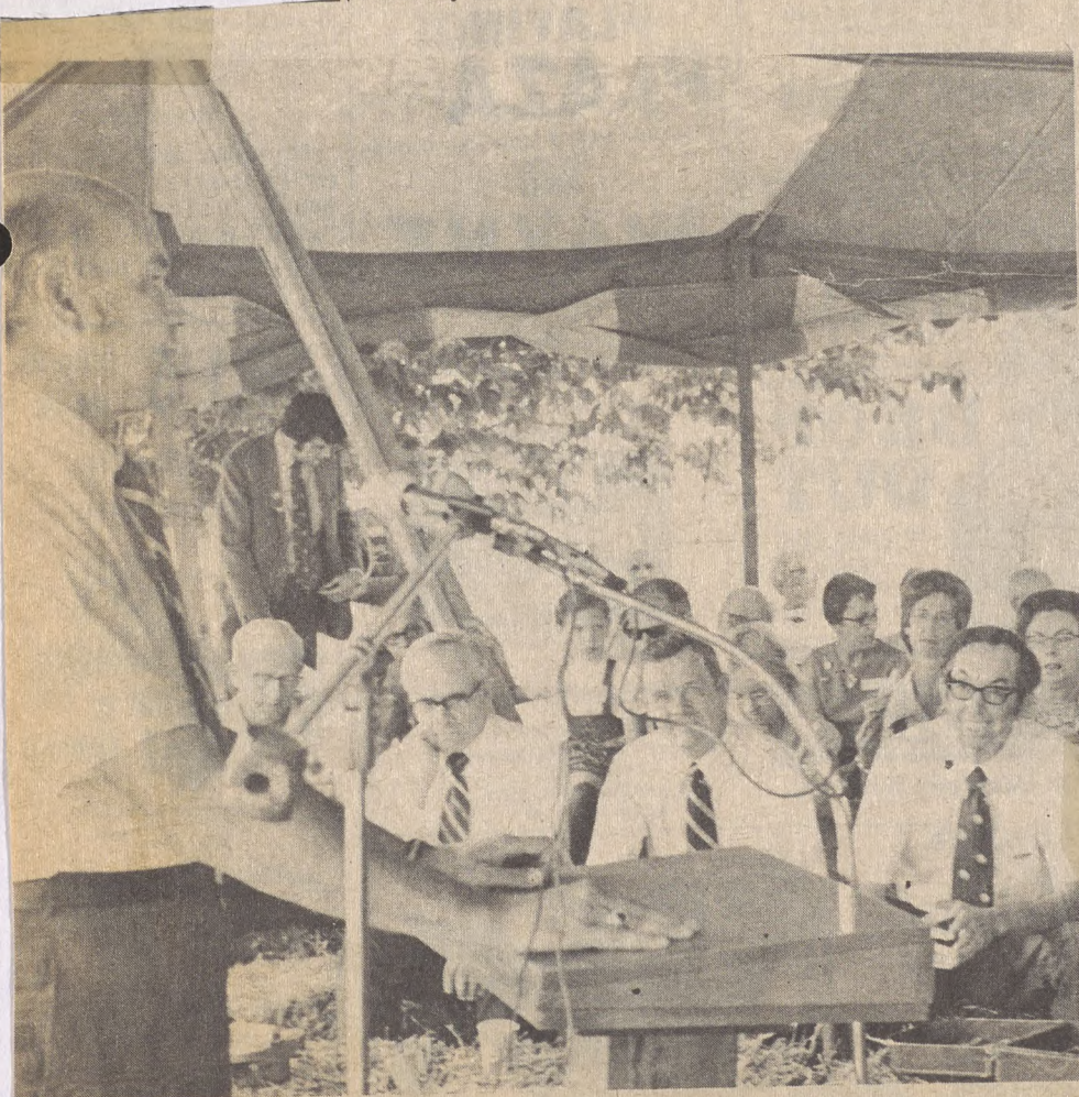
UNDER THE BIG TOP, a red and yellow-striped tent, Ninth District Rep. William Wampler addresses Friday's "Farm Families for Butler Day" gathering at Steeles Tavern. Seated on bales of hay in the front

row are (from left) Undersecretary of Labor J. Phil Campbell, Seventh District Rep. J. Kenneth Robinson, and Sixth District Republican candidate M. Caldwell Butler.