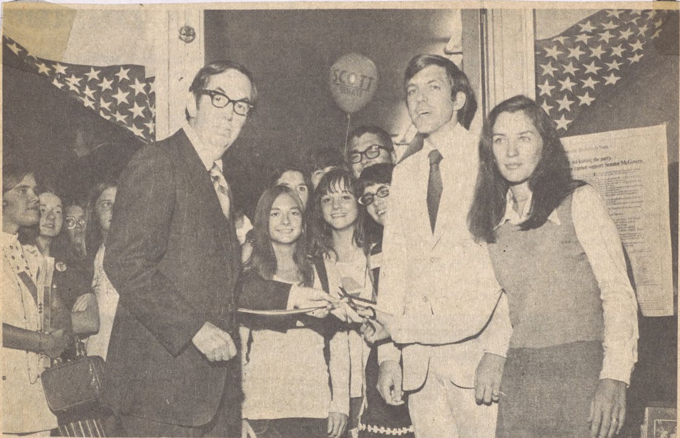
M. CALDWELL BUTLER (left), Republican candidate for Virginia's Sixth Congressional District seat, took part in ribbon-cutting ceremonies for the opening of the Staunton -