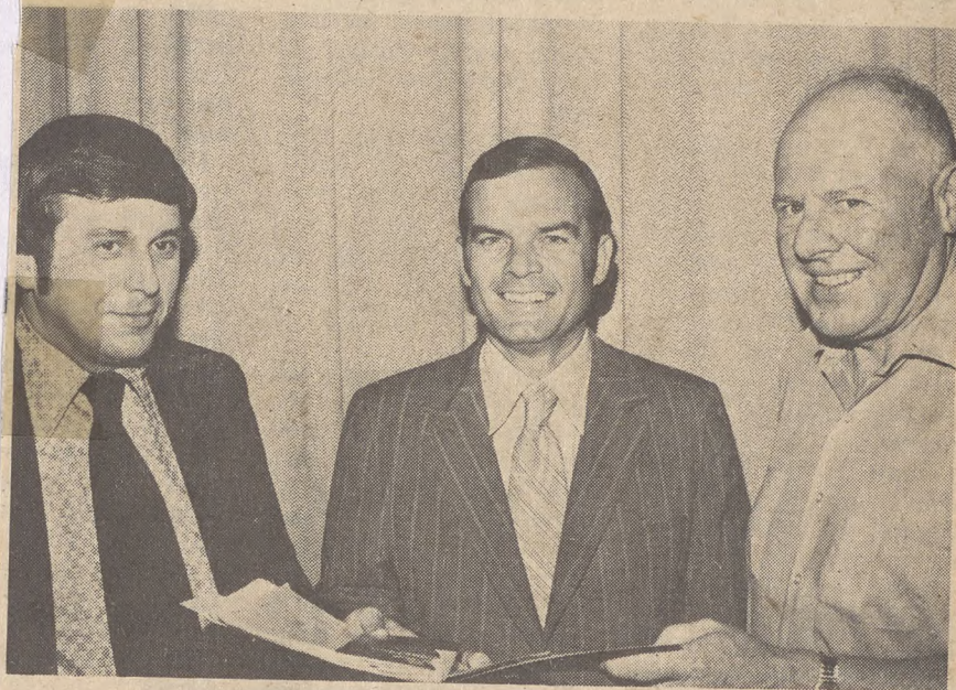
Candidate visits in area