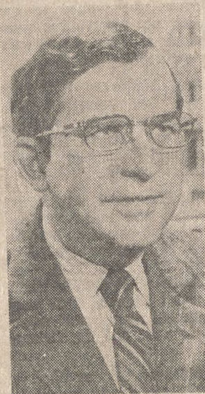
Sen. William B. Spong Jr.