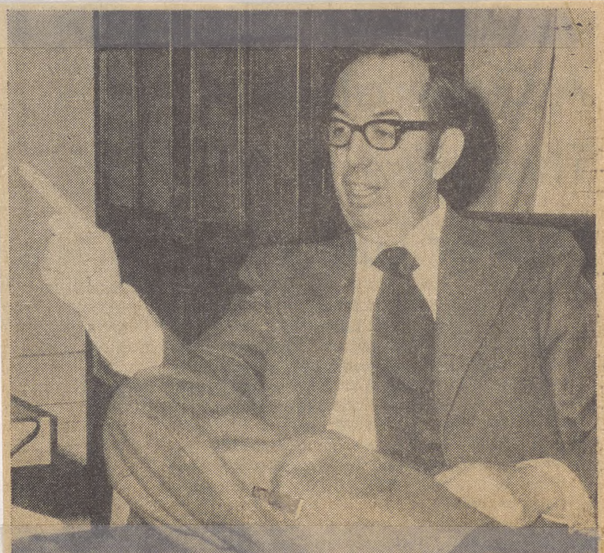
Rep. M. Caldwell Butler Responds To Question