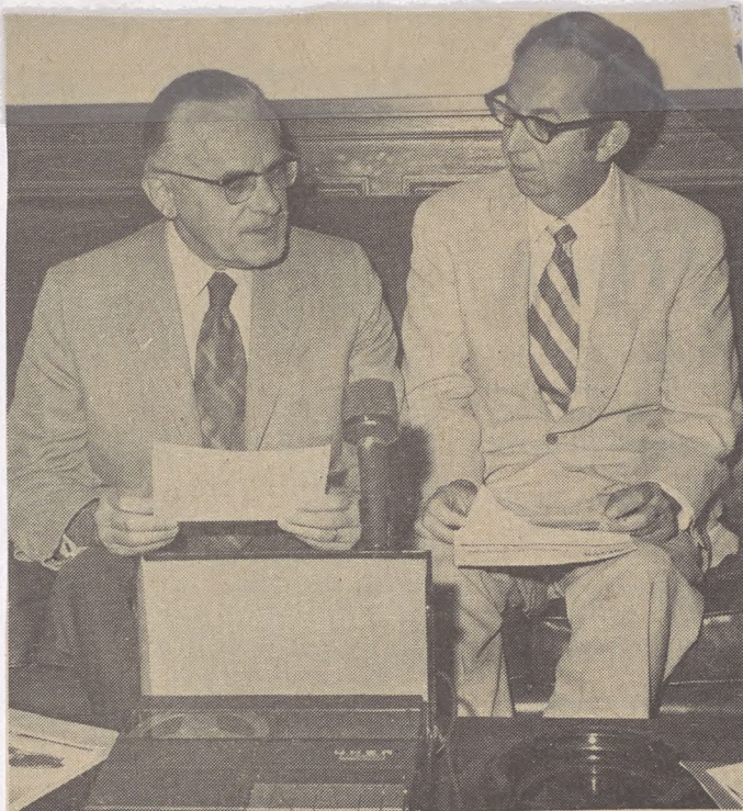
U.S. REP. M. CALDWELL BUTLER meets in Washington recently with Secretary of Agriculture Earl Butz, left, to discuss the Aug. 6 Farm Conference at Ingleside.