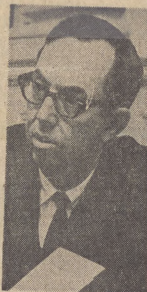
Rep. M. Caldwell Butler

Recalling his decade in the General Assembly at Richmond, Butler said, "We used