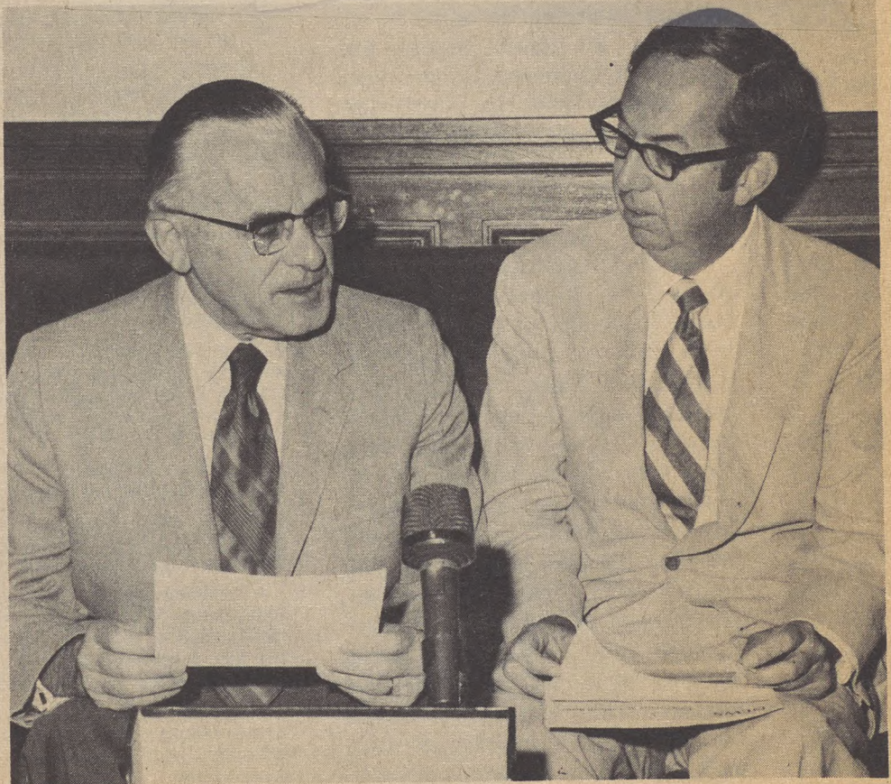
SIXTH DISTRICT Rep. M. Caldwell Butler (right) discusses plans for the Farm Conference to be held Aug. 6 at Ingleside Hotel