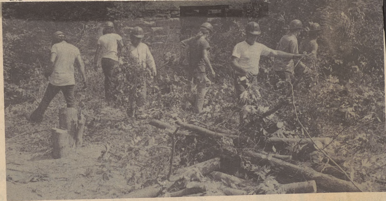
Ann Dyer's crew was clearing brush and felling trees last week in preparation for the HUD funded channelization of Indian Gap Run near its confluence with the Maury River. The storm sewer

drainage improvements are part of the $450,000 community block grant program that is aimed at taking willing workers off the unemployment lists.