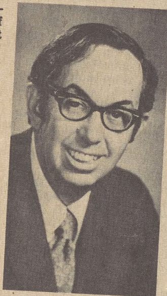
M. Caldwell Butler