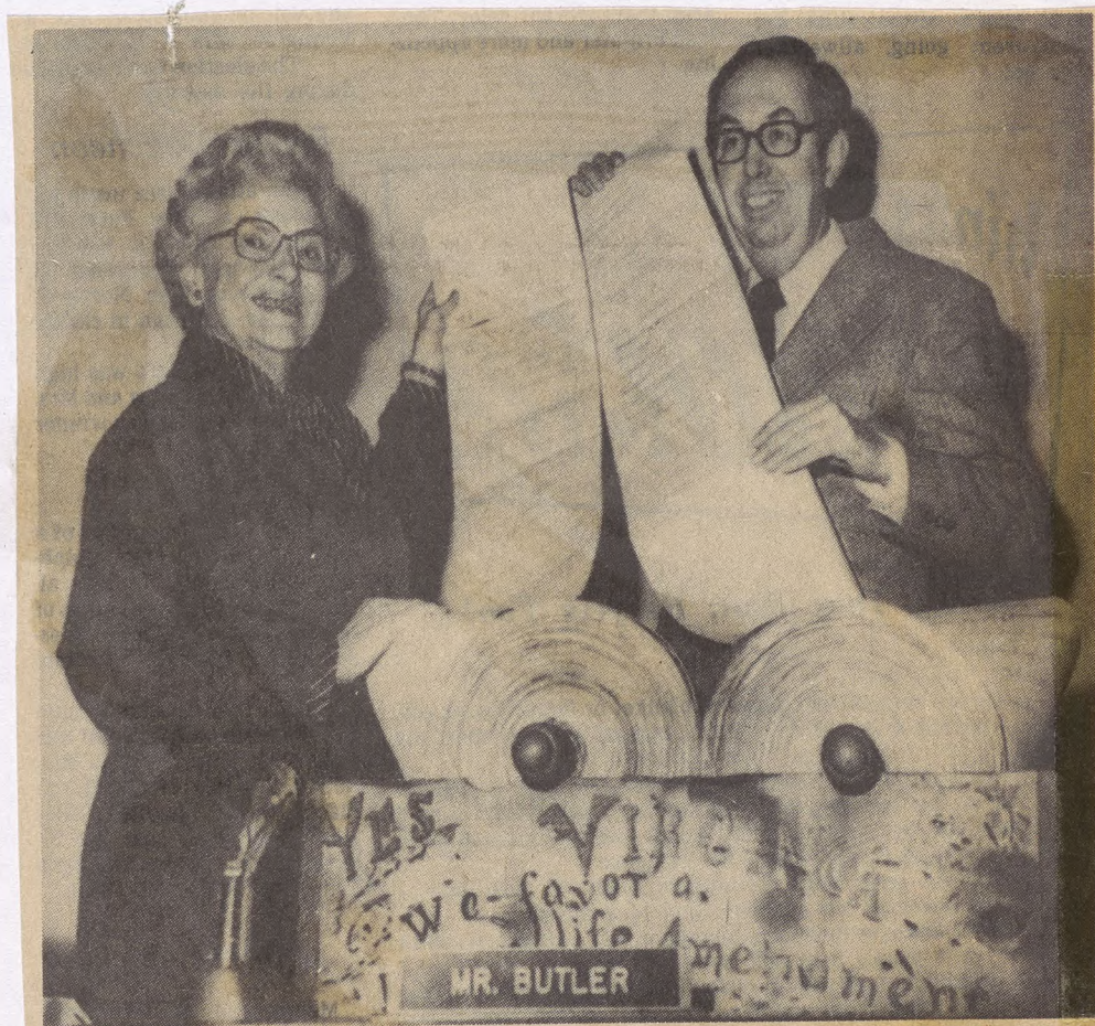
THE NEWS, Lynchburg, Va., Fri., Feb. 6, 1976

AGAINST ABORTION — Rep. Virginia Smith, R-Neb., in Washington Thursday presents Rep. M. Caldwell Butler, Republican of Virginia's Sixth District, the ranking minority member of the House Judiciary subcommittee on civil and constitutional rights, with two rolls of petitions against abortion. The subcommittee is holding hearings on proposed constitutional amendments on abortion.