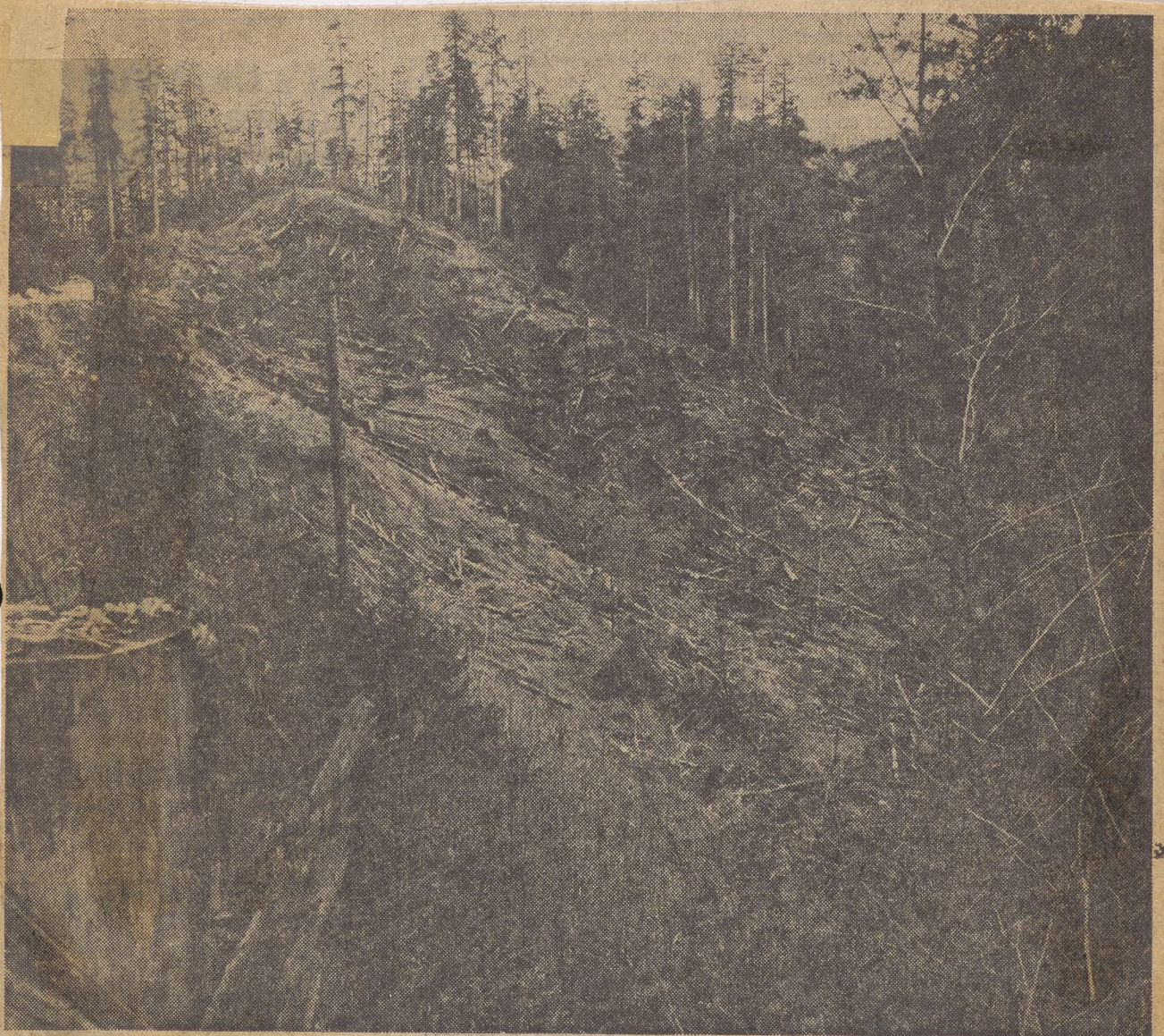
An example of clear-cutting in a national forest