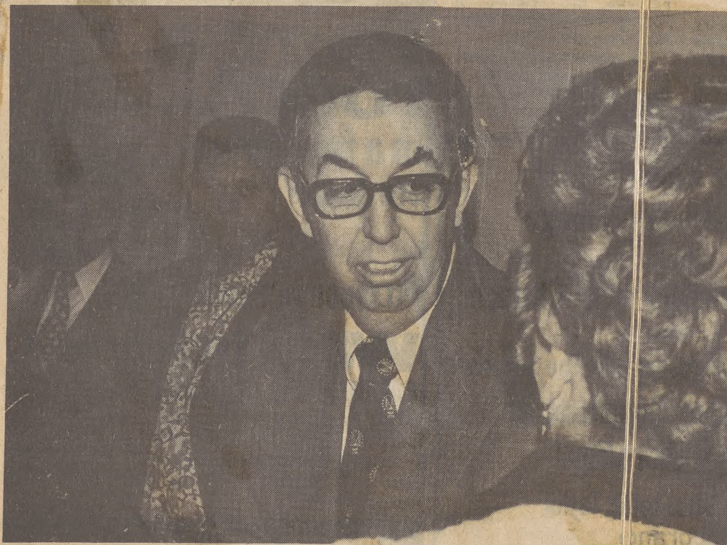
U.S. REP. M. CALDWELL BUTLER chats with one of the more than 200 persons who attended a Lincoln Day dinner at Riverheads High School Saturday night. The annual dinner is sponsored by the Augusta County Republican Party.

Warning of the dangers of "accommodating the demands for power", Rep. Butler urged the Scouts to select "your goals according to your needs".